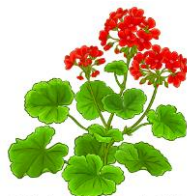
Gathering and Growing in Christ